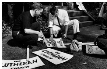
Lutherans gather in Washington, D.C., to prepare for the March on Washington for Jobs and Freedom in 1963.