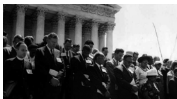
Lutherans and Protestant groups gather in Washington, D.C., to commemorate the 10th anniversary of the Supreme Court ruling mandating desegregation in 1964.