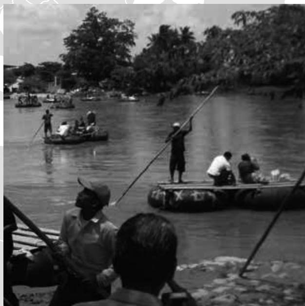
Families in search of a better life cross Guatemala’s border by boat.

Schaefer and other students from the Lutheran Theological Seminary at Gettysburg (Pa.) traveled to Honduras and Guatemala to better