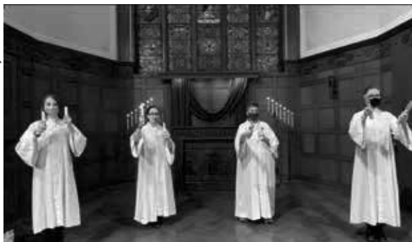
Youth Chime Ensemble participants play a Change Ring prelude for online worship at St. Luke Lutheran Church in Park Ridge, Ill.