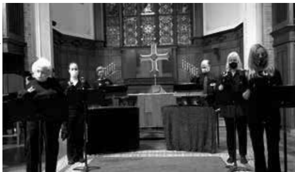
Masked and socially distanced handbell ringers record a prelude for online worship in the sanctuary at St. Luke Lutheran Church in Park Ridge, Ill.